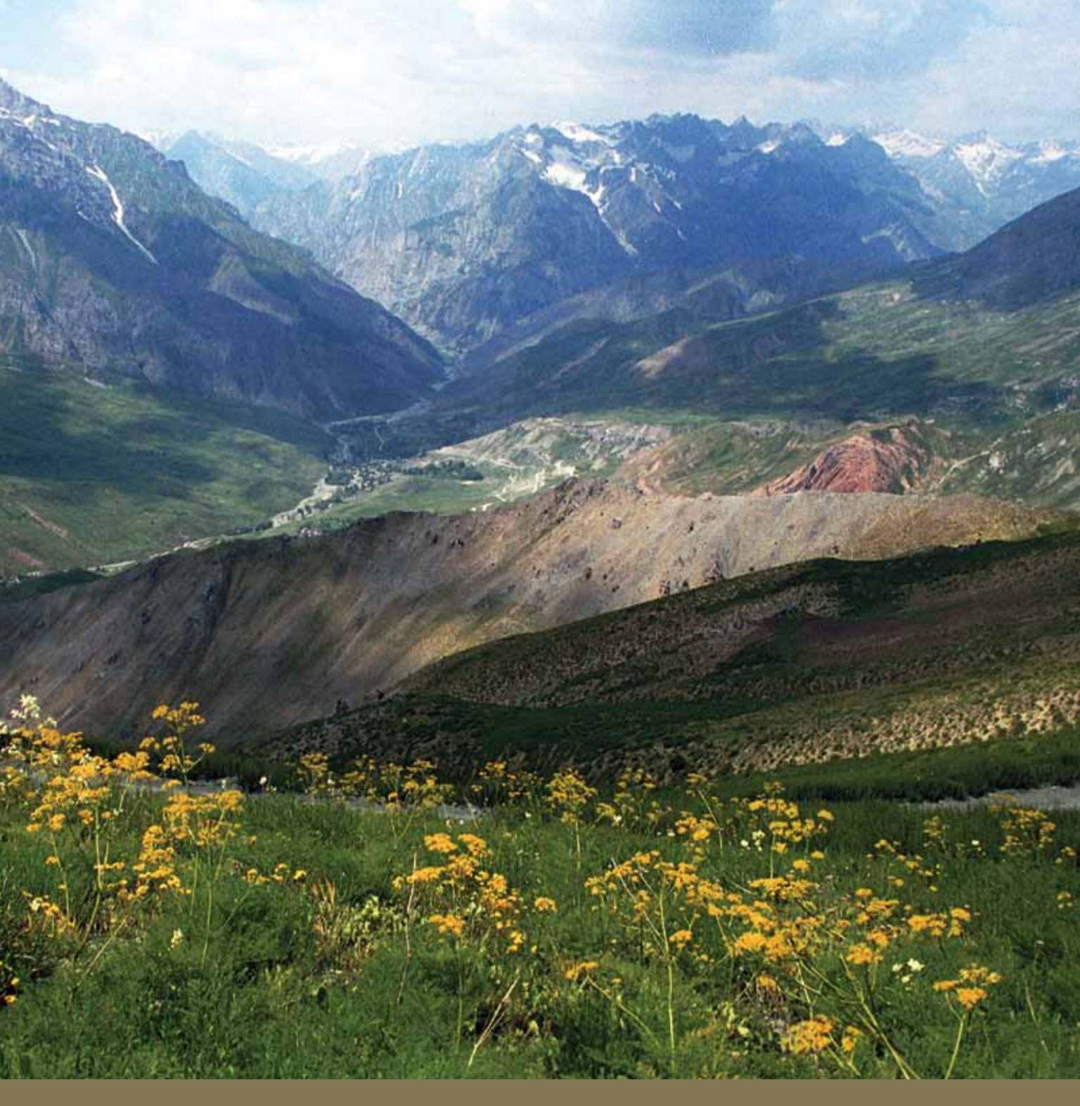
Mountains in Tajikistan.