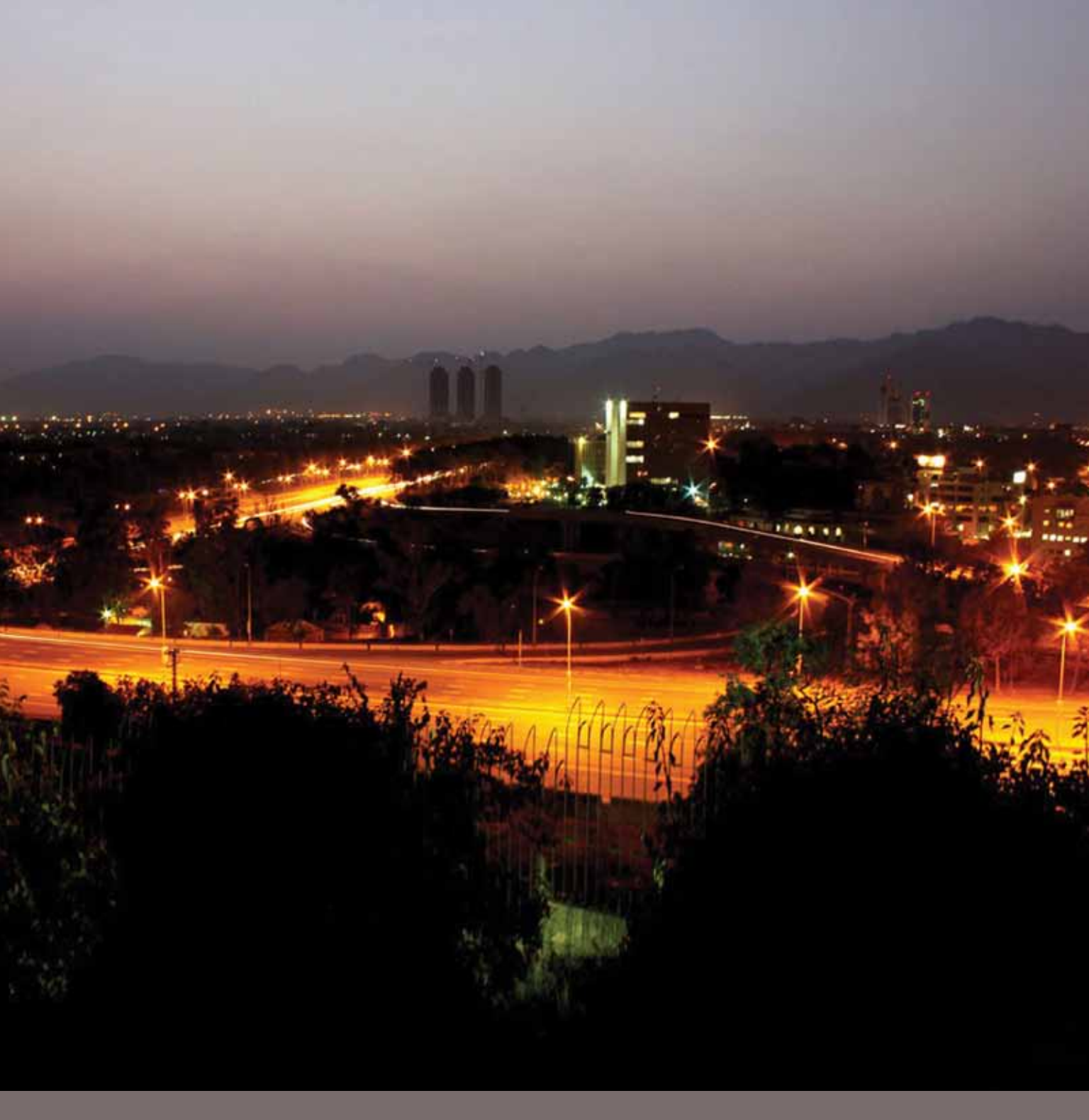
Islamabad streets at night