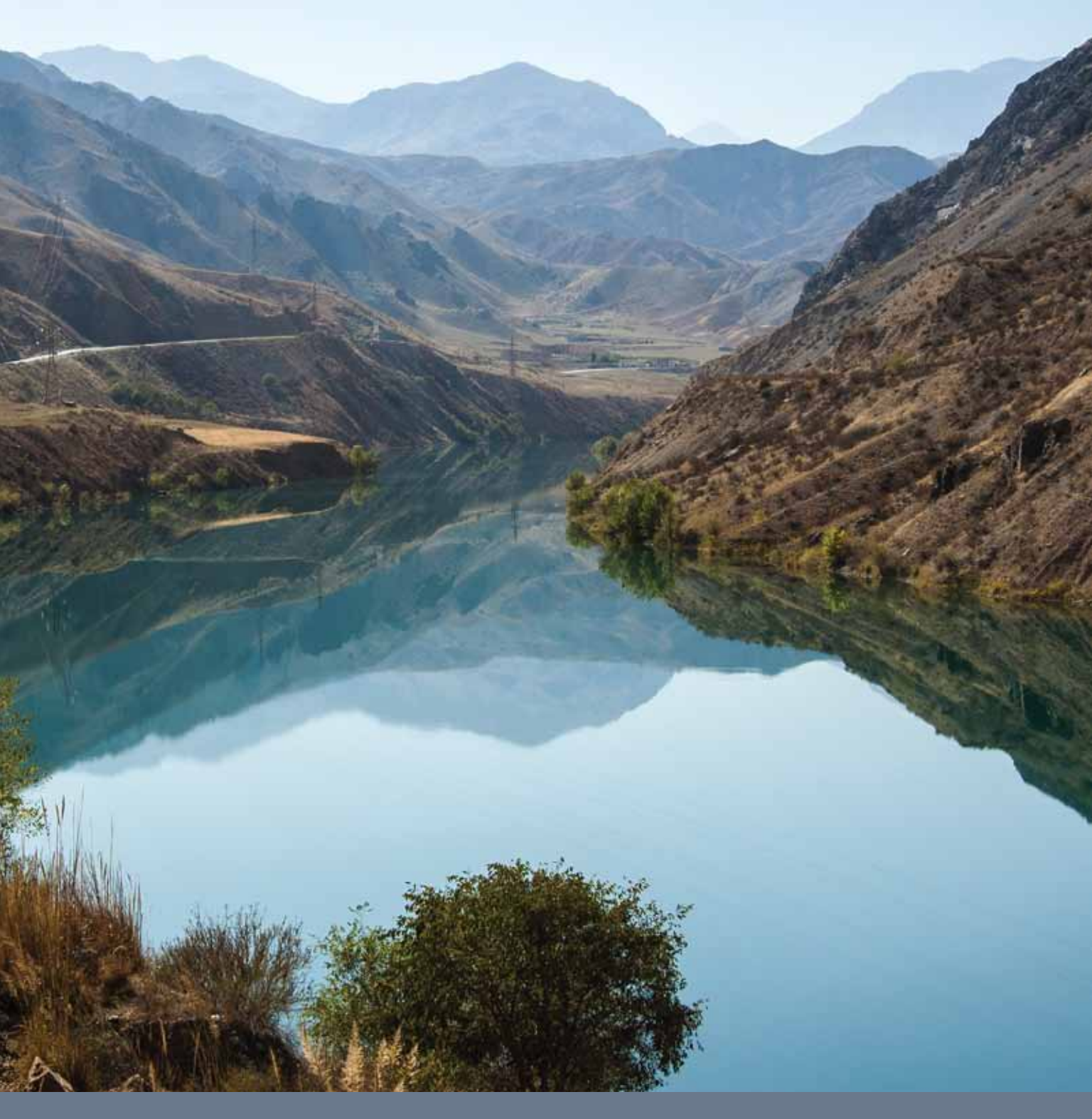
Reservoir in the Kyrgyz Republic.