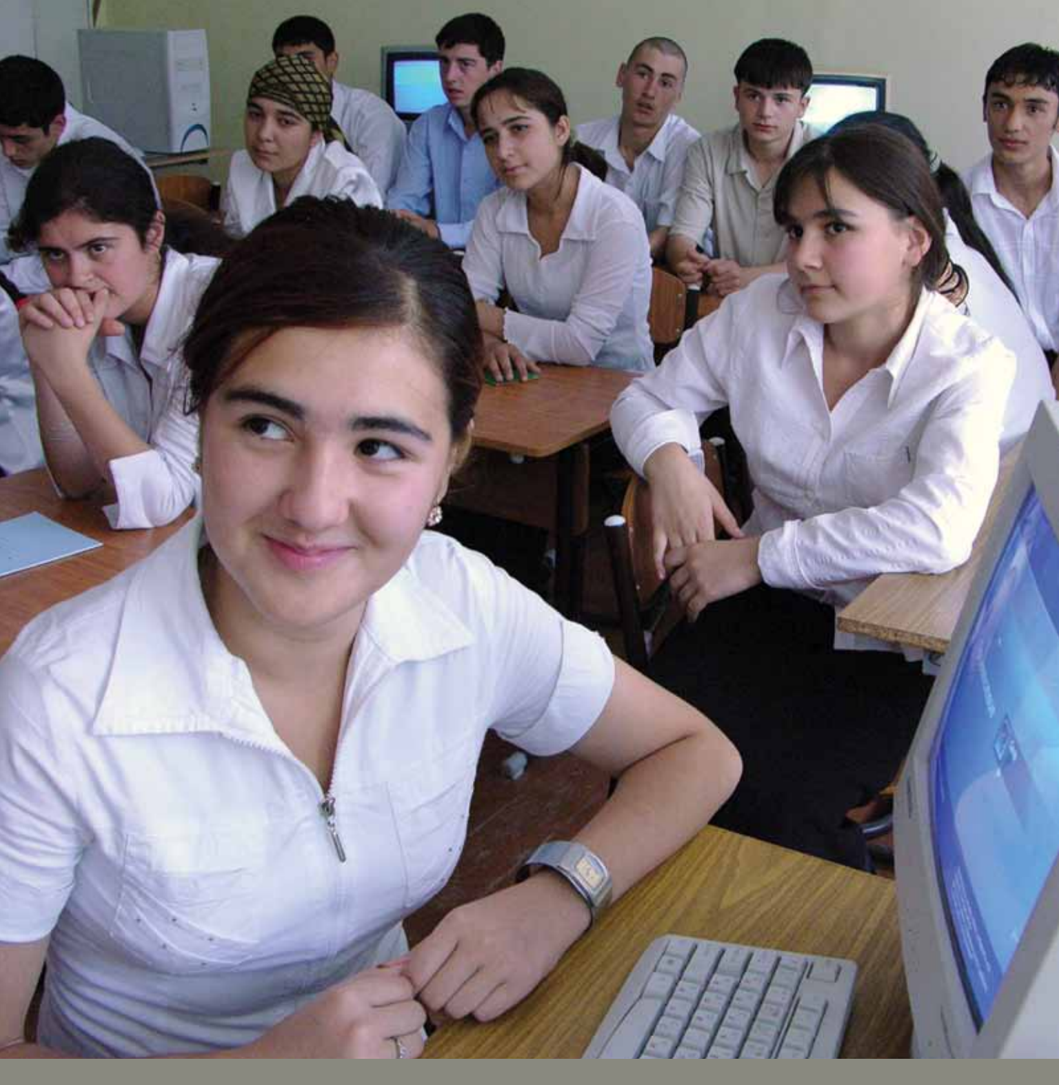
Students in Tajikistan.