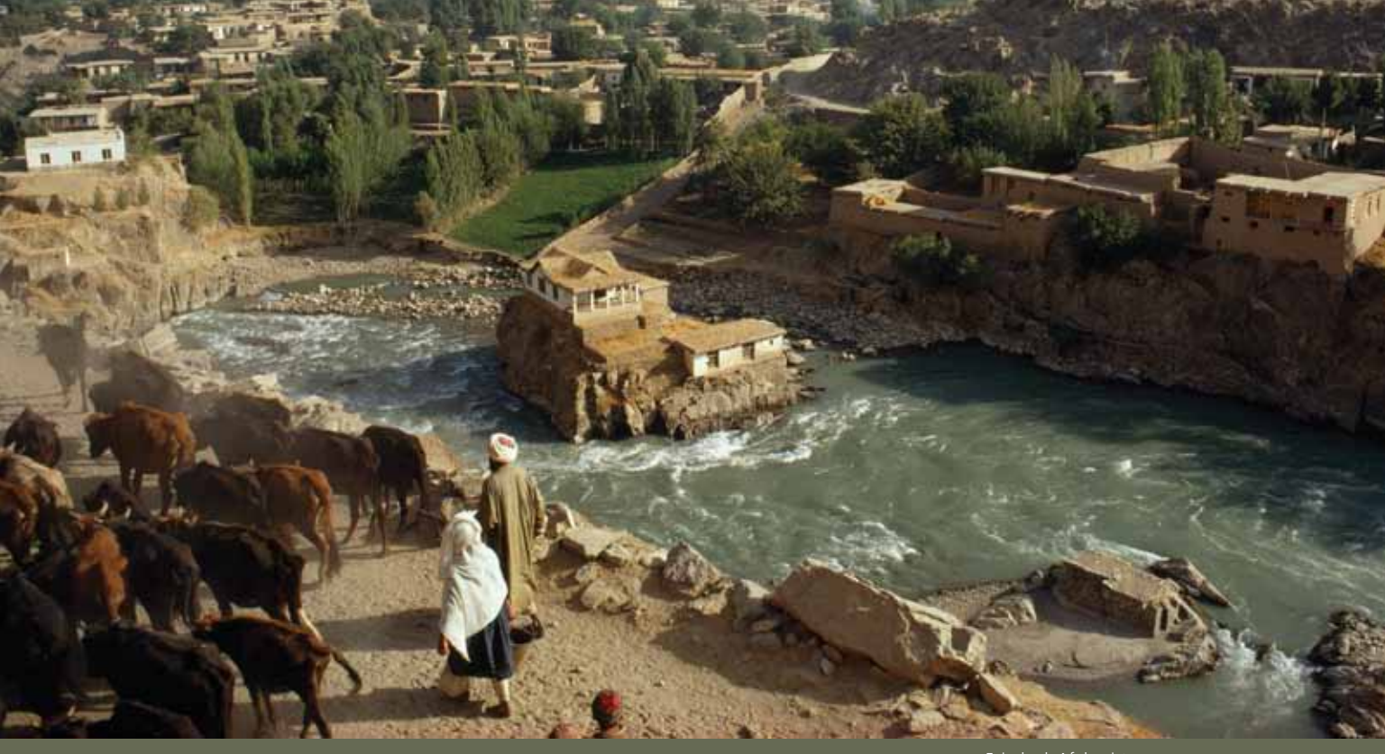
Faizabad, Afghanistan