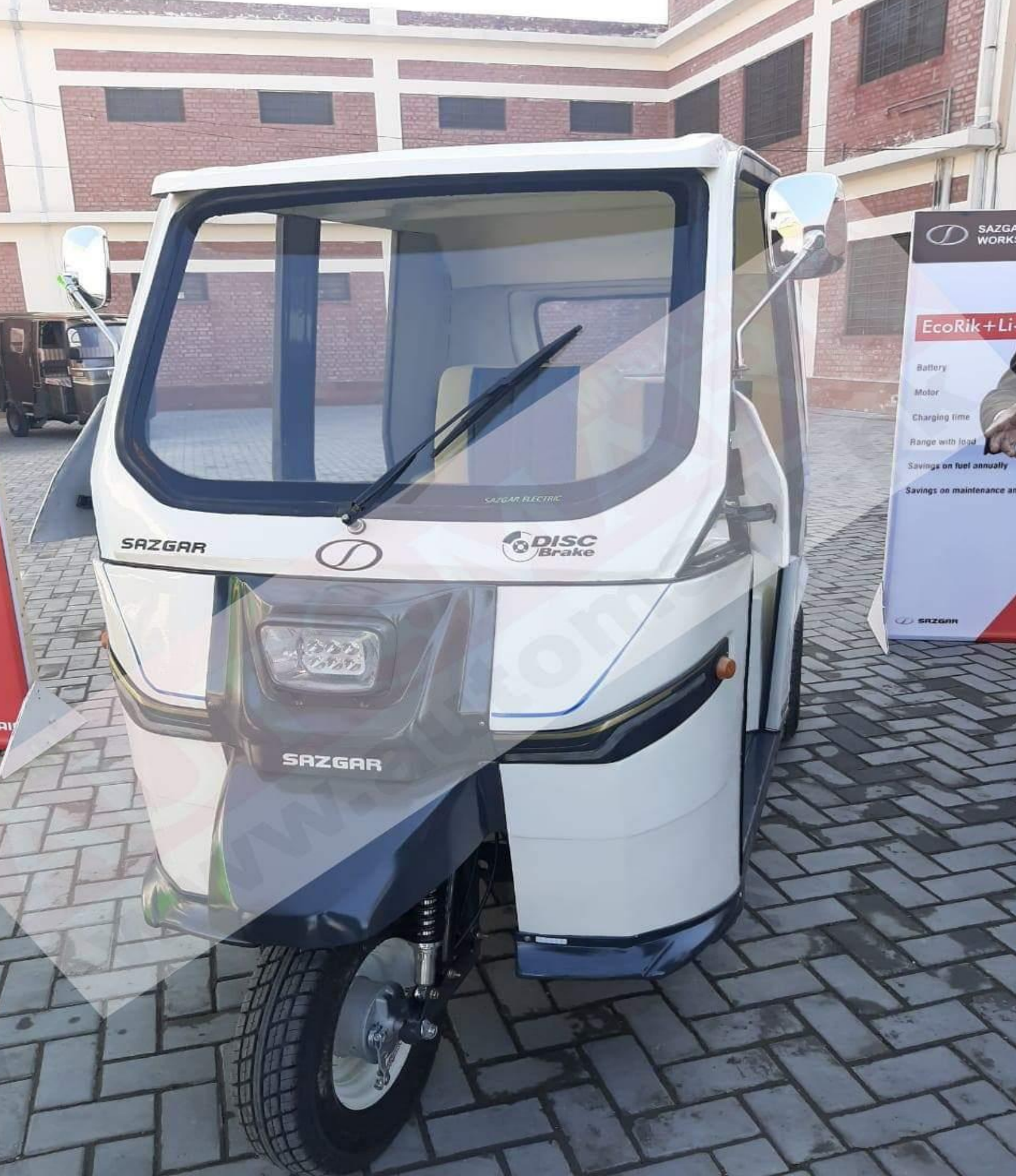
Pakistan's First 3 – Wheeler EV, SAZGAR