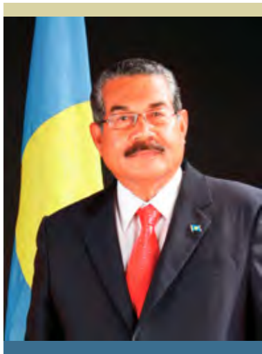
H.E. Johnson Toribiong President of the Republic of Palau

Palau, like the rest of the world, faces two major energy challenges. The first is to deliver clean, secure, affordable energy for all citizens of Palau while treating the environment responsibly. The second is to respond to the risks of climate change by adaptation to changes and by mitigation through reducing the greenhouse gases caused by the production and use of energy. In addition Palau faces a challenge that it shares with other small island countries, namely it's extremely high dependence from imported fuels.