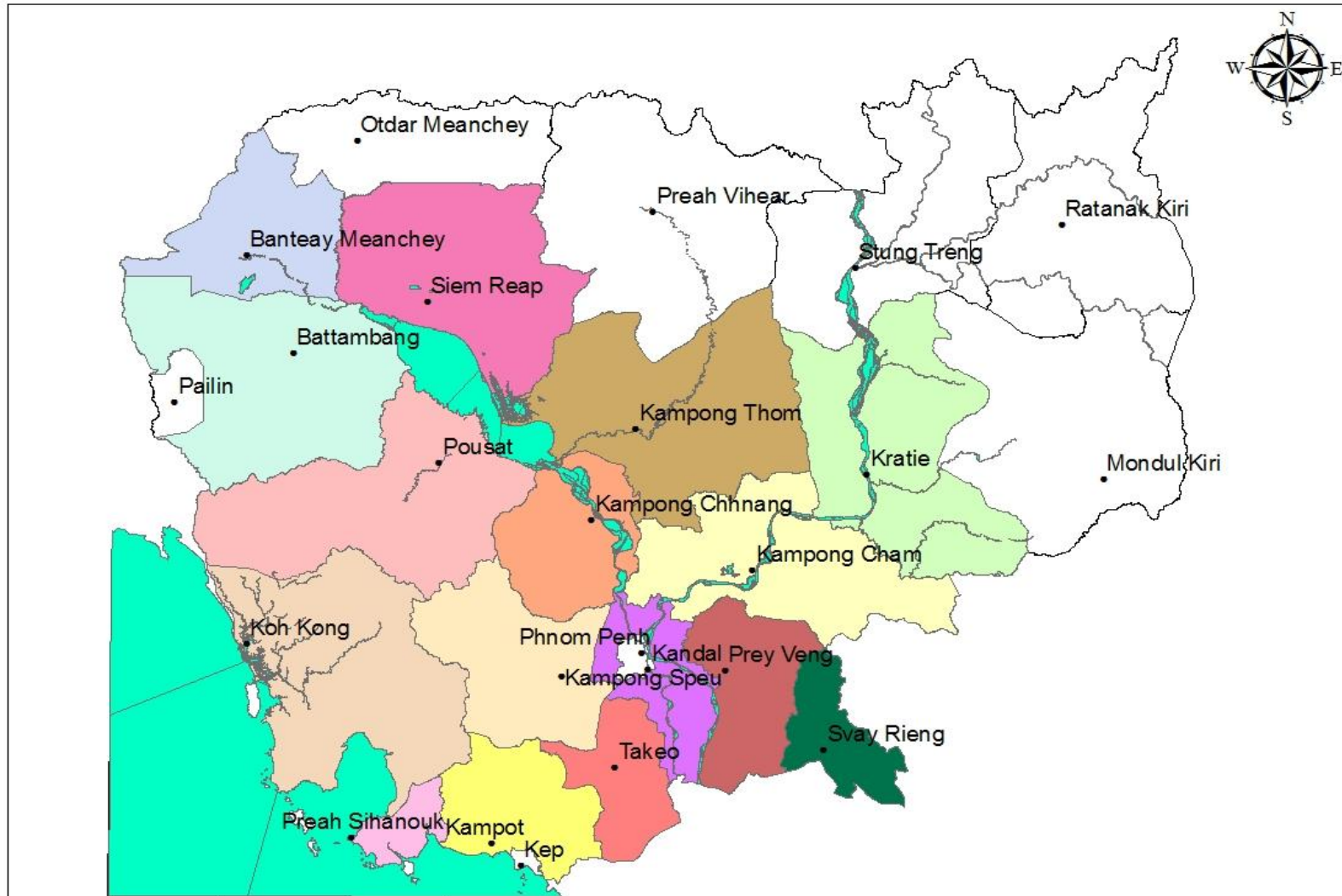
Map showing the provinces for which REF provides Assistance to improve existing and and develop electricity infrastructure in rural areas in 2014