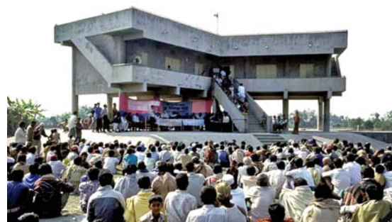
Cyclone Shelter, Noakhali, Bangladesh

multipurpose cyclone shelters in the next 10 years in the coastal belt. The newly built cyclone shelters also double as government/non-government primary schools under the Primary Education Development Project and also as community centres for training and recreation. These shelters have been or are being provided with solar lighting, rain-water harvesting, separate rooms for pregnant women, bathrooms, doors and windows, first aid boxes and 2-4 tubewells, which were absent in previous cyclone shelters. All shelters are 3-storied with one floor for keeping animals when a cyclone strikes and have provisions for vertical extension in their foundation.