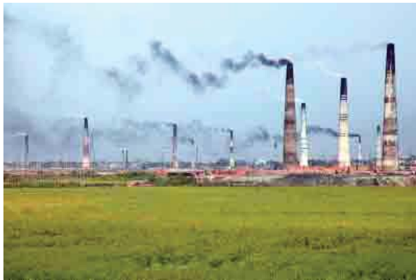
Traditional brick kiln

The government has made an agreement for wind mapping in 5 coastal areas over the next one year with support from an Indian company to eventually set up a wind turbine based 15 MW power plant. The success of the pilot project will determine future expansion of wind energy in the country.