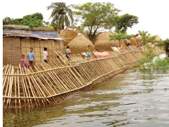
Community led initiatives-Protecting village from wave erosion, Sunamganj.

Some salient institutions and capacity building instruments created under CDMP-I include, among others: Climate Change Cell in the Department of Environment, National Risk Reduction Action Plan, Corporate Plan of Ministry of Food & Disaster Management, Strategic Risk Reduction Plans, Local Disaster Risk Reduction Plans, Standing Order on Disasters, Disaster Impact Risk Assessment, incorporating Risk Screening Tool in planning process and enhancement of community coping mechanisms. The country has launched CDMP-II in 2011, which has integrated climate risk management (CRM) in the disaster risk reduction (DRR) process.