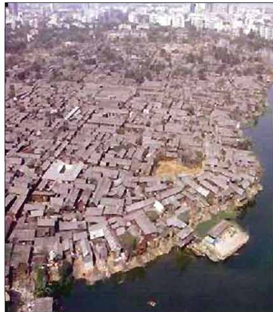
Part of Karail Boasti, Dhaka

Public parks and open spaces are vanishing fast to encroachers and developers. Therefore, the