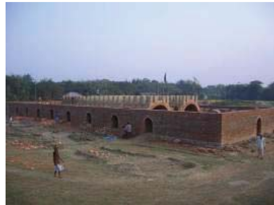
Energy efficient "green" brick kiln