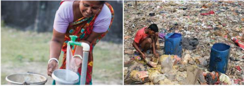
Left: Solar powered pumping system supplying clean drinking water through water tanks mounted on hurricane-proof overhead concrete platforms.