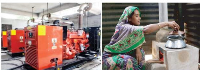
Left: Biogas based Electricity Generators at Gazipur (4 X 100 kW capacity).

Bangladesh is the world’s sixth largest rice-producer. Parboiled rice is deeply rooted in Bangladeshi culture and way of life. It is the staple food of about 160 million people in Bangladesh. Most of the Parboiled Rice (about 80%) is produced at 50,000 small and medium-sized rice mills in the country. The traditional boilers used in rice parboiling are quite unsafe, cause occasional explosions leaving casualties of operators and on lookers.